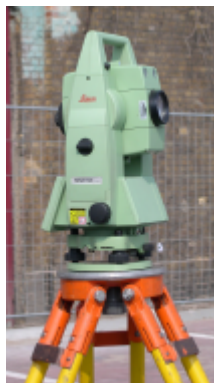
Figure 3. Total station Leica TCRA 1103

At the moment the software works with Leica total stations of the TRCM and TCRA types of the 1100 series. The program FAMES for the Façade Measurements uses the GEOCOM interface to control the total stations.