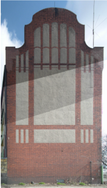
Figure 8: Geometric image mosaic