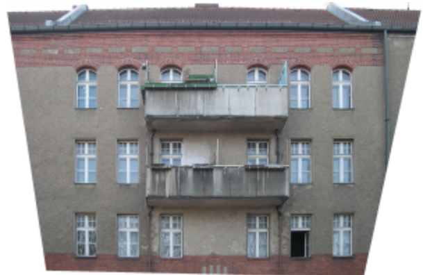
Figure 2. Insufficient result from projective rectification – the balconies are dislocated.

But a total station is required at each documentation site to provide the control network and good digital cameras become affordable. Therefore the idea was borne to combine a modern, motorized total station and a digital camera to derive digital orthoimages of architectural objects, primarily of facades.