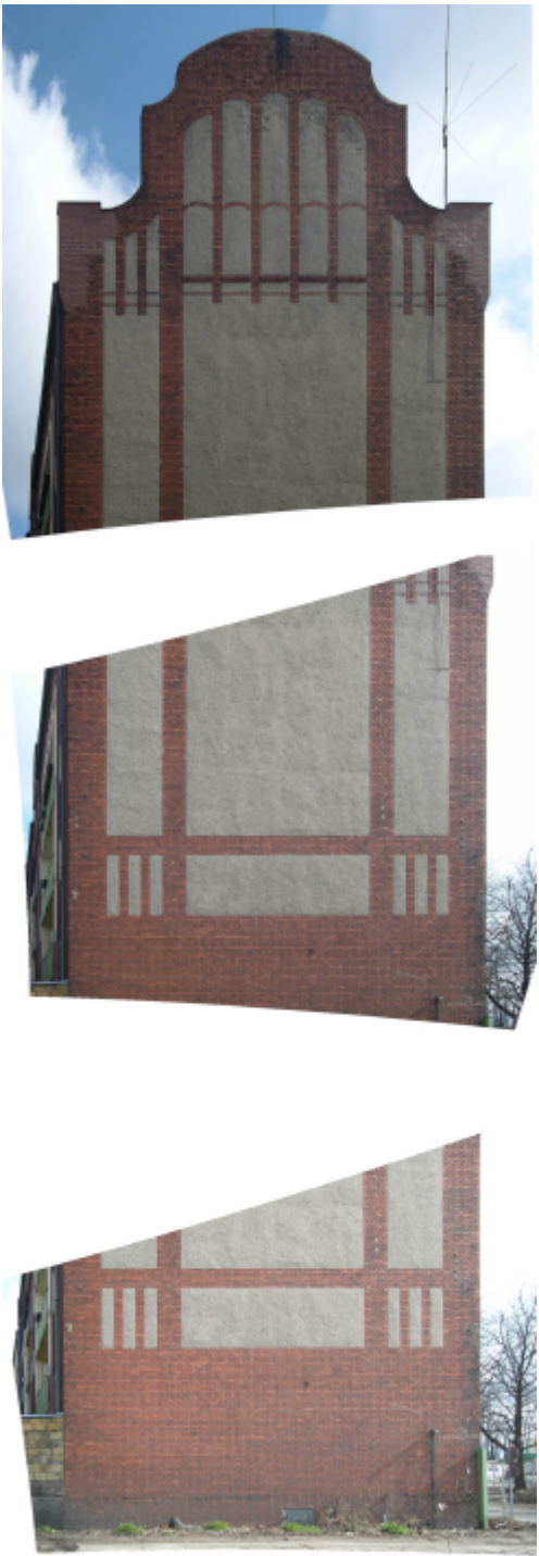
Figure 7: Parametric rectified images