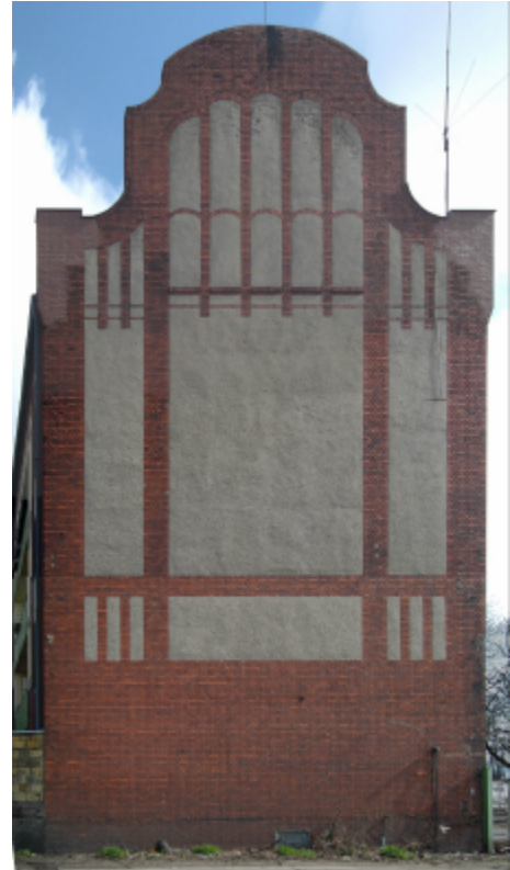
Figure 9: Mosaic after radiometric adaptation