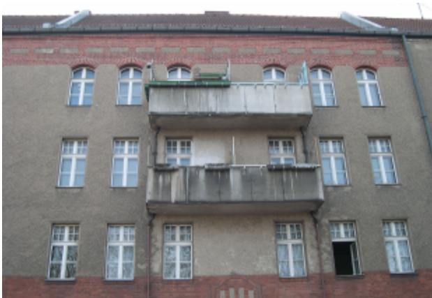
Figure 1. Image of an object

For the documentation of cultural heritage geometric and thematic information is required. There is a large variety of different techniques to acquire the high quality geometric information of cultural significant buildings. Among them are geodetic techniques, photogrammetry and laser scanners. Laser scanners and stereo photogrammetric equipment are expensive and requires skilled personnel for the usage. The application of such expensive equipment and personnel is only justifiable for large projects with big budgets. Most projects have very limited resources and most buildings do not demand the usage of laser scanners at the complete site. Single image photogrammetry and bundle photogrammetry are well suited for simple objects with a limited number of sharply defined geometric features. Tacheometry of the whole object might be a time consuming process, depending on its complexity.